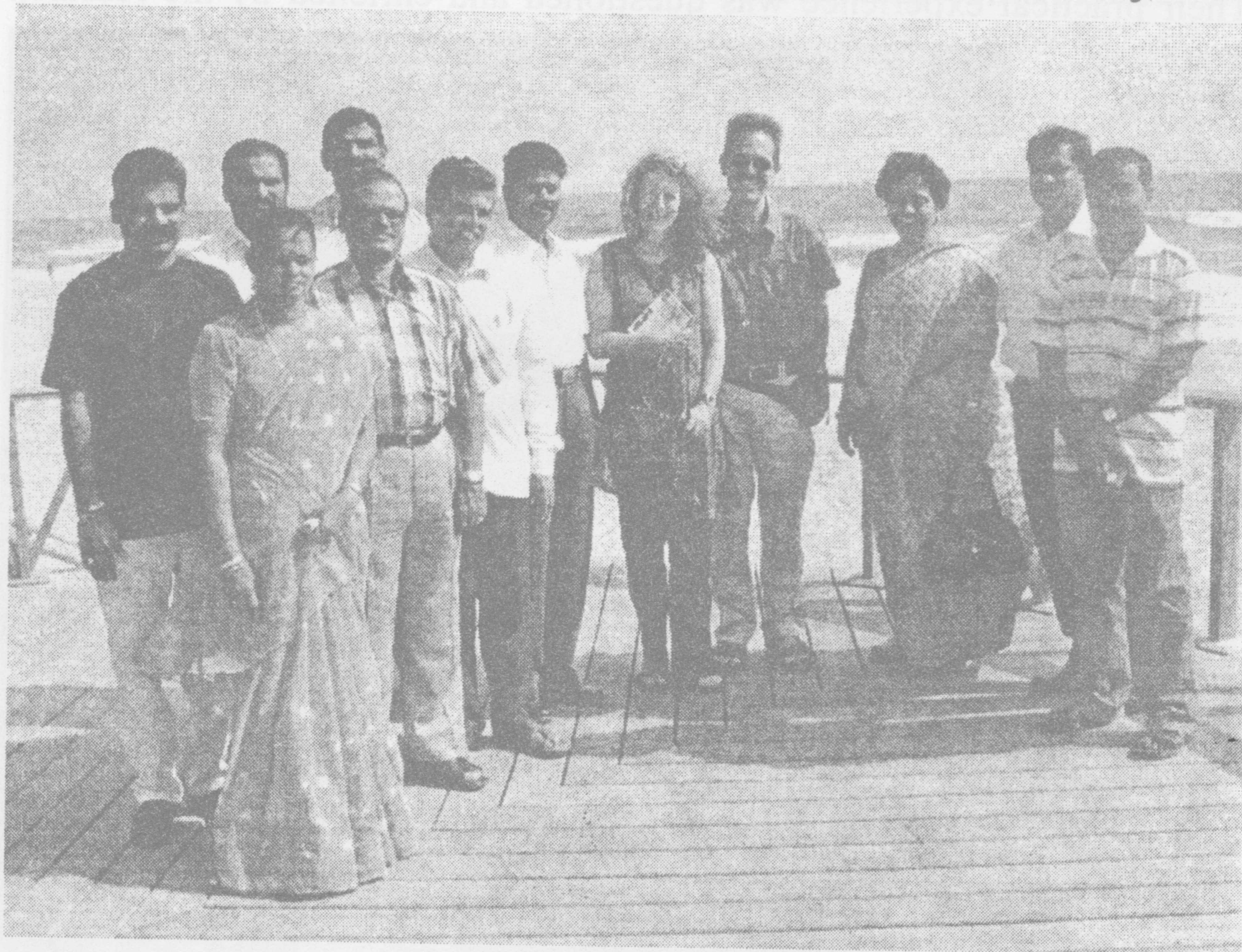
Mamallapuram with family and colleagues (January 2007)